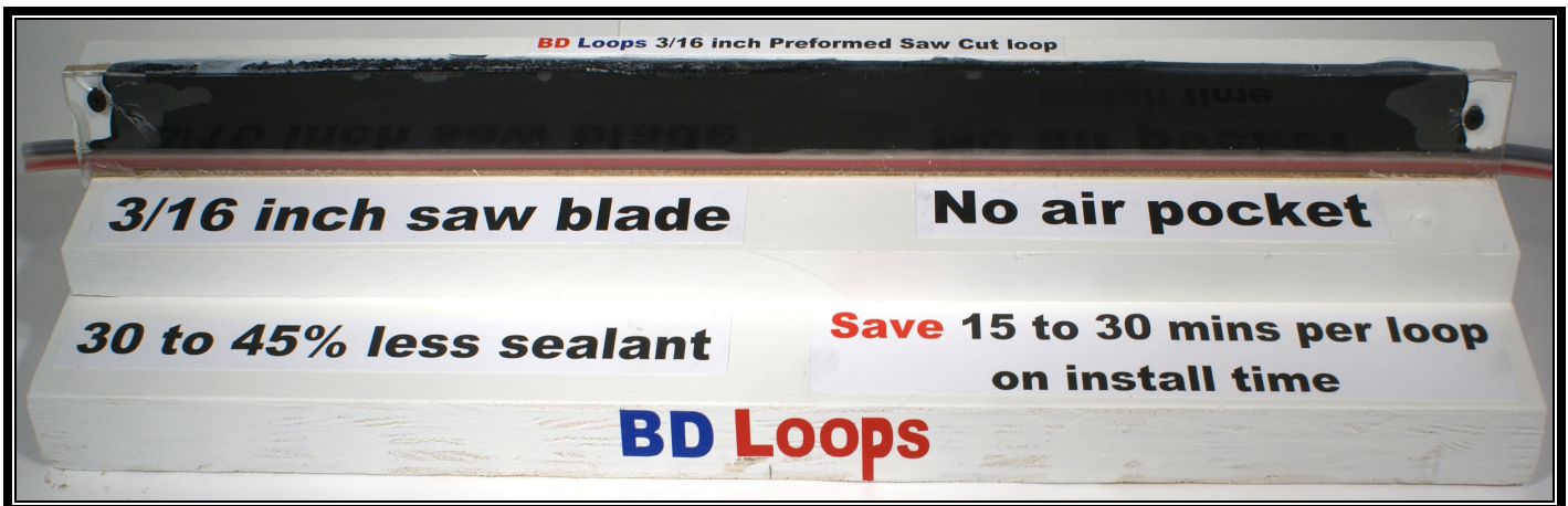
BD Loops preformed saw-cut loops have no air pocket