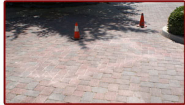
Saw-Cut Tattoo Concealed with Sand

Quite an improvement! We hope you find this trick helpful. Please feel free to share your experiences / photos of job sites using the sand trick.