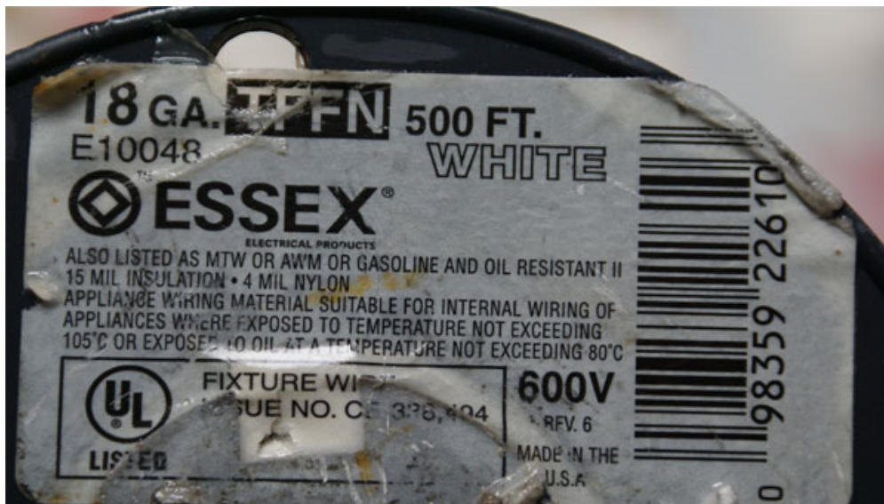
18AWG TFFN Wire

We tested a popular wire used to wrap loops: TFFN 18 Gauge wire as shown below: