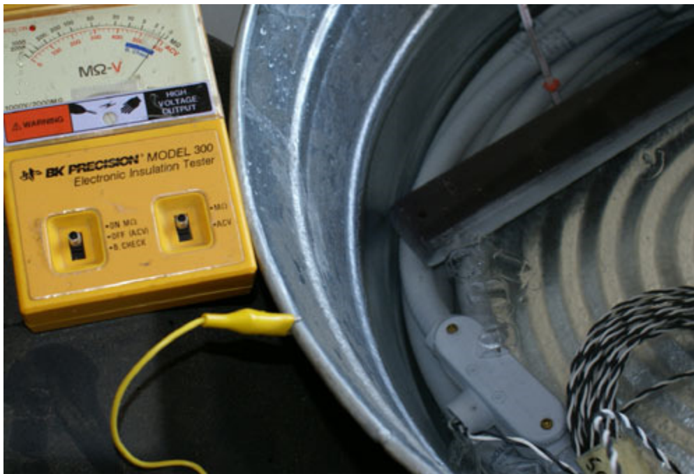
The loop shorts to ground and air escapes through the yoke.

shallow 2" flood during a heavy rain or a deep 2-3' flood.