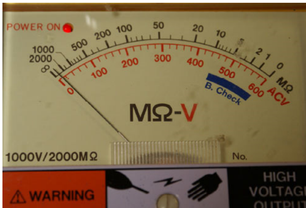
Our loop reading over 2000 MΩ , even under such extreme conditions.

Our Preformed Saw-Cut and Direct Burial Loops do not have an air pocket, as I mentioned above water is the enemy of inductance loops and we have done our best to make sure water stays out of our loops. Loops are subject to flooding, especially in locations where rain is common (think of all the times you've driven through a flooded intersection). We took this into account when designing our preformed loops, loops must be waterproof to withstand wet conditions.