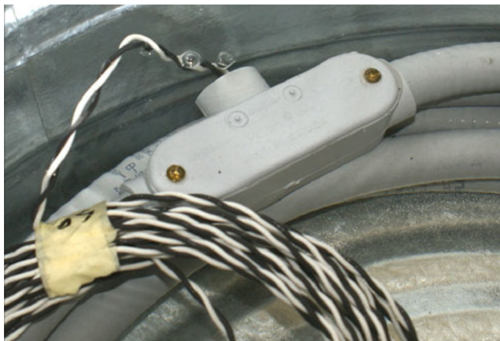
Preformed Loop with an Air Pocket

We tested a popular 4'x 8' 18 Gauge PVC Preformed loop with 50' twisted Lead-in as shown below against a BD Loop: